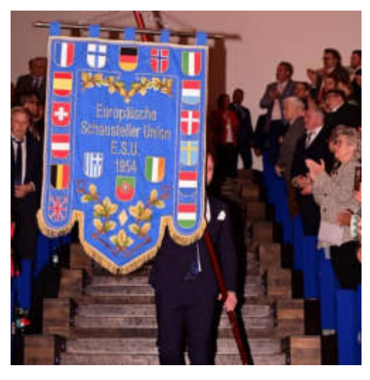
Procession of the flags.