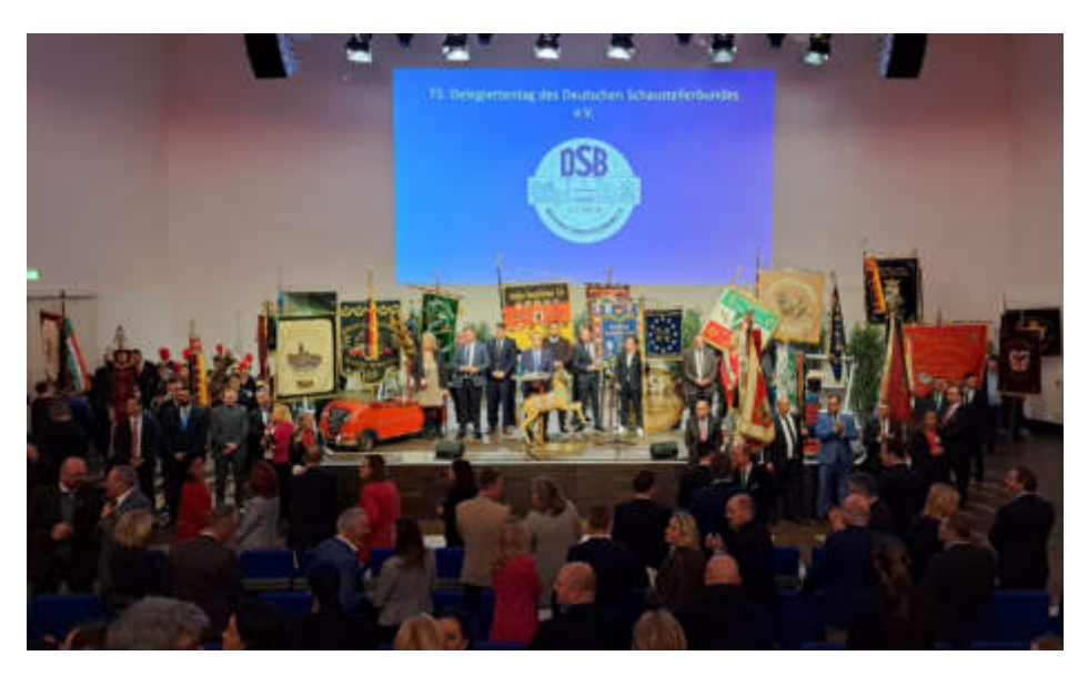
View into the auditorium of the Congress Centre Düsseldorf.

Politicians take a stand on Europe-wide showman issues