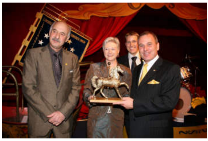
The ESU Parliamentary Evening took place in Brussels on 28 November 2007 with the participation of numerous members of the European Parliament. The festive highlight was the awarding of the "Golden Carousel Horse" to the Minister of Economic Affairs of the Netherlands, Maria van der Hoeven (2nd from left).