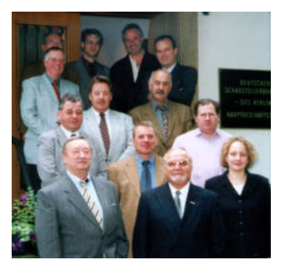
Meeting of the ESU Presidium 2001 in Bonn.