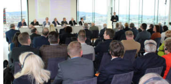
Festive evening at the ESU Congress 2014 in Dublin. Business meeting at the 2020 Congress in Vienna.