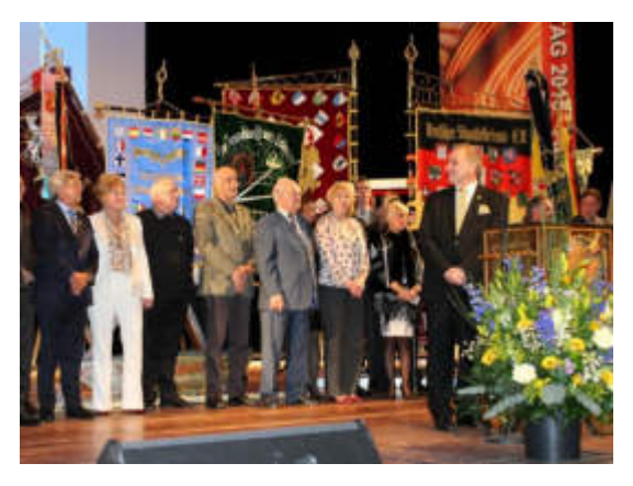
ESU delegation at the 2015 German Showmen's Association rally in Aachen.