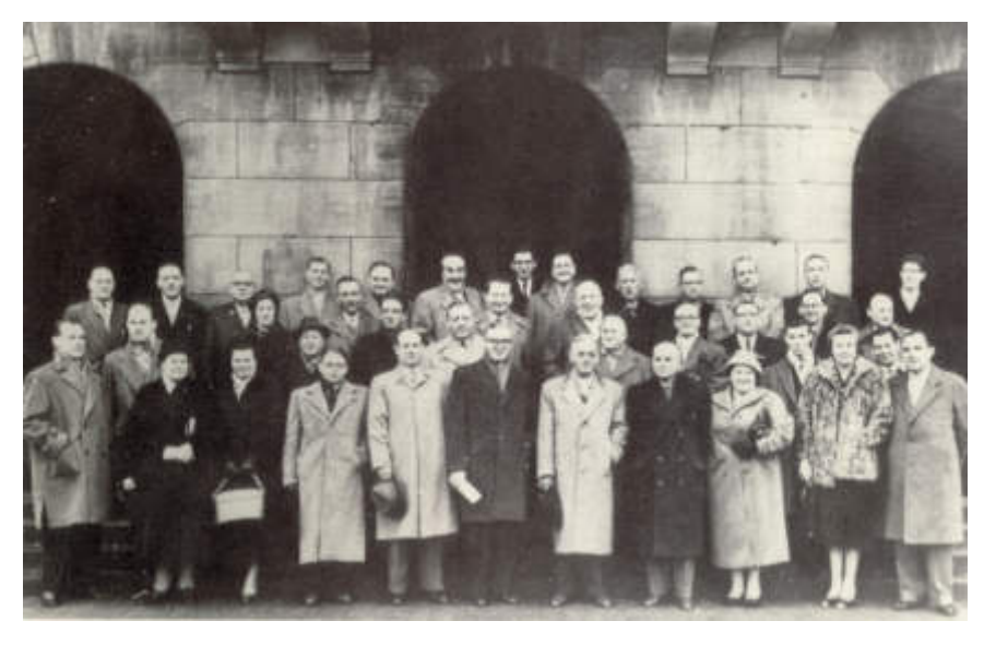
The 1st ESU Congress was held in Amsterdam in 1957.

Picture review of the 70th anniversary of the European Showmen's Union